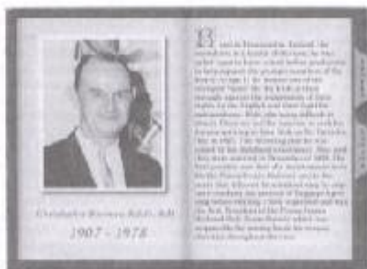
A STANDARD MULTIMEDIA MEMORIAL INCLUDES ONE PHOTOGRAPH AND ONE PAGE OF TEXT SO THE MEMORY OF A LOVED ONE WILL BE REFLECTED WITH ELEGANCE.

Please call the cemetery office for information and price details. An information package will be mailed to you for your consideration.